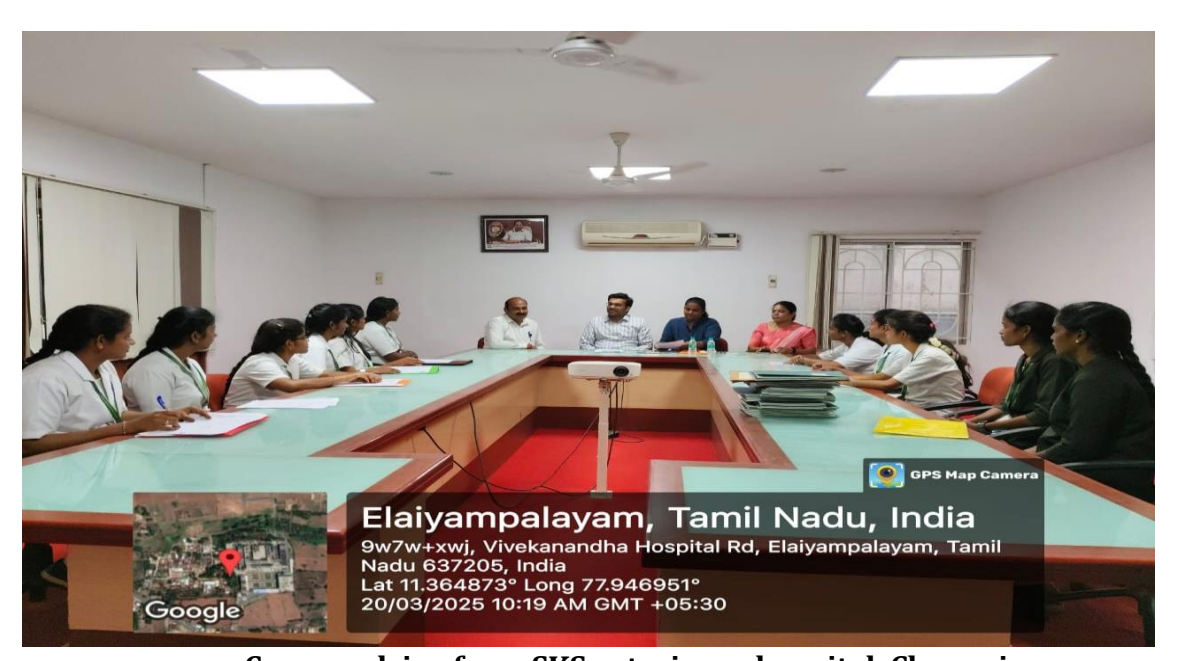
Campus drive from SKS veterinary hospital, Chennai