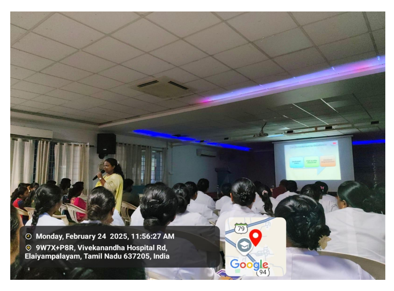
Pre Placement activities for Career guidance