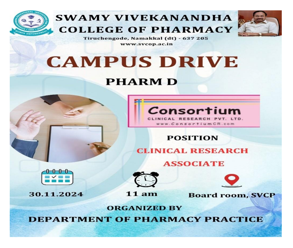
Flyer - Campus Drive from Consortium Clinical Research, Bangalore