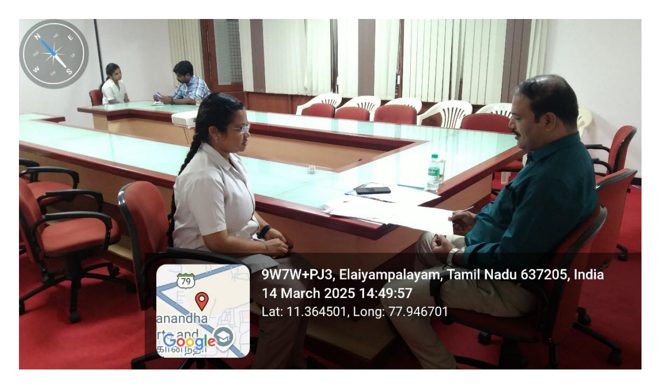
Campus drive from Apollo Pharmacy, Coimbatore