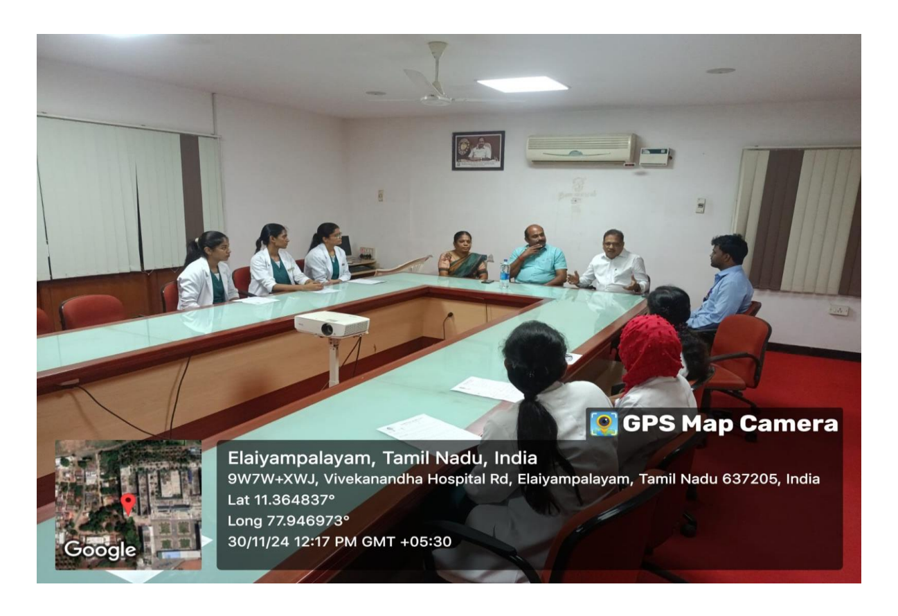
Pharm.D - Campus Drive from Consortium Clinical Research, Bangalore